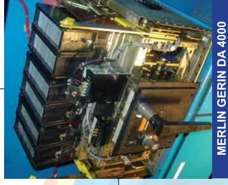
MERLIN GERIN DA 4000