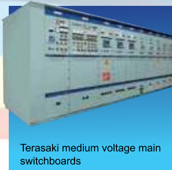
Terasaki medium voltage main switchboards