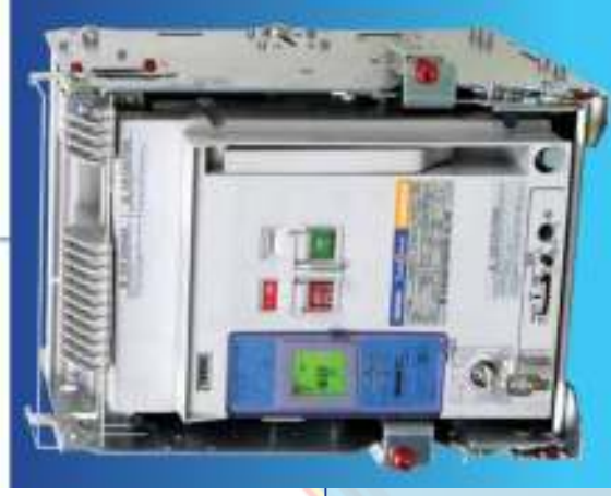
TERASAKI TEMPOWER 2 RETROFIT ACB