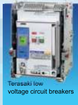
Terasaki low voltage circuit breakers