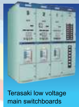
Terasaki low voltage main switchboards