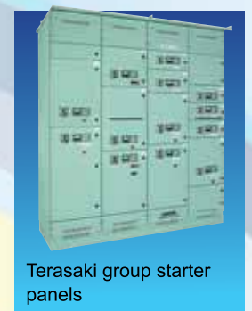
Terasaki group starter panels