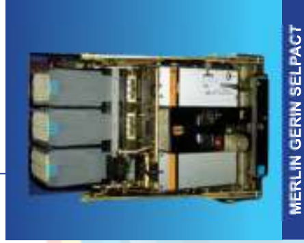
MERLIN GERIN SELPACT