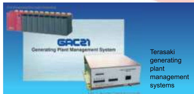
Terasaki generating plant management systems