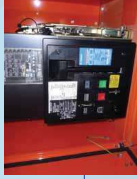
TERASAKI TEMPOWER AT