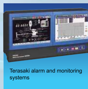
Terasaki alarm and monitoring systems